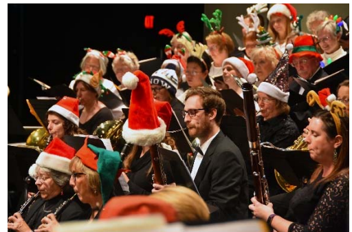
Orchestra of the Southern Finger Lakes (OSFL)